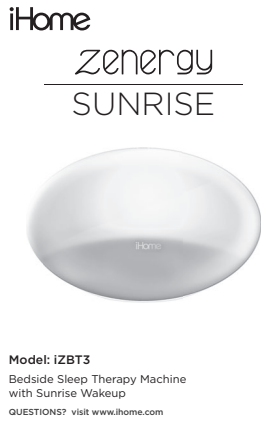
Model: IZBT3 Bedside Sleep Therapy Machine with Sunrise Wakeup QUESTIONS? visit www.ihome.com

IZBT3 - QSG (English) Size: 510x 150 mm (folded 102 x 150 mm) Material: 157g Art paper Color: 1C + 1C (black) Mar. 05, 2021